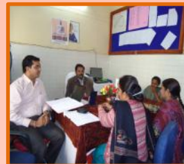
Orientation and on site demonstration to staff