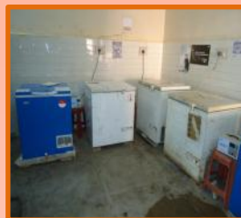
Cold chain room