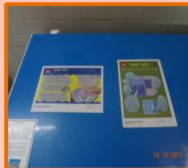
Use of job aides