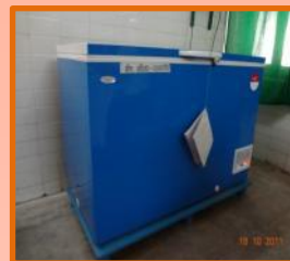
Correct arrangement of equipment