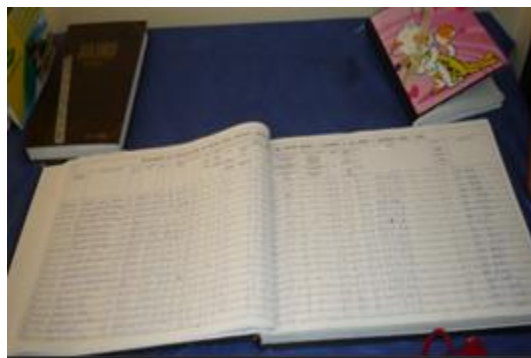
Data collection register for HBB at birth

MCHIP and the MCH Centers of Excellence presented technical indicators related to basic newborn resuscitation and essential newborn care at birth. Furthermore, MCHIP developed a register allowing for the collection and analysis of these new newborn health indicators (pictured right). In 2013, data collection was initiated in three regional hospitals (San Lorenzo de los Mina (los Mina), San Vicente de Paul Regional Hospital (HSVP), and Dr. Antonio Musa Hospital (MUSA). These indicators were recommended for inclusion in the national health management information system during stakeholders meetings with the MoH for advancement of a newborn health action plan. An initial analysis showed actions related to the practice of HBB. Of 19,200 live births from April 2012 to March 2013, 677 newborns in four centers did not cry at birth (3.5%); of these, 240 (3.5% of babies not crying) required and were successfully resuscitated with bag and mask ventilation.